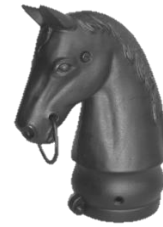
ORNAMENTAL HORSE HEAD