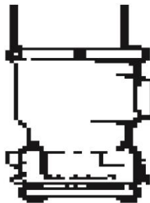
**Kwikonect Style Pressurized