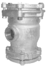
DQ SERIES PITLESS KIT