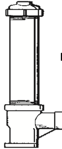
PJ PITLESS UNIT